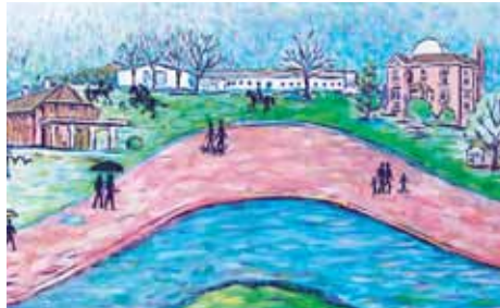
Mural downtown panel 2 shows Albion in the Spring. Scene includes the train depot (Mowrer Agency), the Nancy G. Held Equestrian Center, and the observatory, home of the Prentiss Brown Honors Institute.

January 2015 went by quickly in Albion with mild weather compared to 2014, followed by a Super Bowl Sunday blizzard on 2/1/15 with ~16” of snow. Albion events and opportunities are growing. Albion College is offering a variety of music, art and cultural events in March and April. See the new Google calendar for links to events at AlbionMich.com/general .